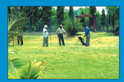
Sports & Recreation

...conducted by masters and practitioners.